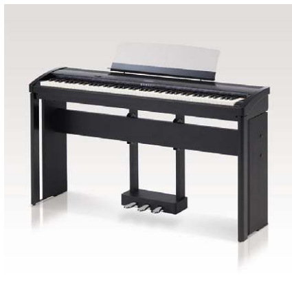
HM-4 designer stand, F-301 triple pedal (sold separately)