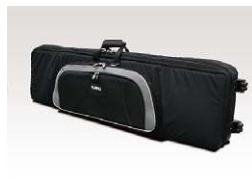
Gig-bag with castors