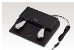
F-20 damper/soft pedal