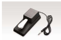
F-10H damper pedal