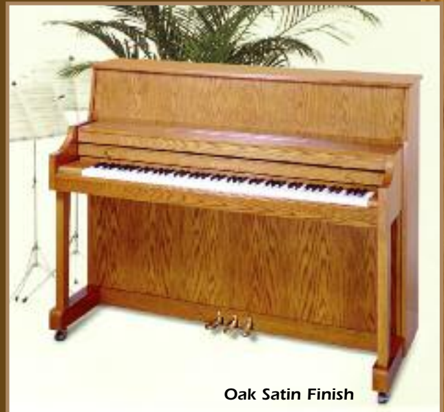
Oak Satin Finish

The 506N embodies three fundamental elements of a fine piano... an exceptional soundboard made of solid spruce, a durable back assembly with sturdy back posts, and our exclusive Ultra-Responsive™ Direct Blow Action. These important elements ensure a level of tone, touch and durability that will satisfy the needs of any pianist.